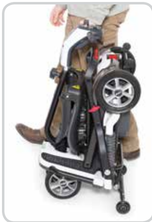
Easy to Transport