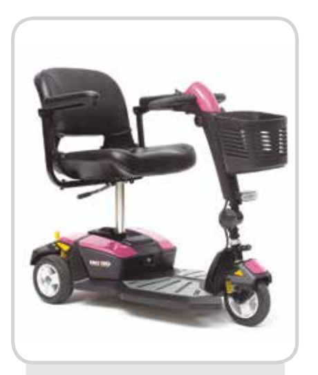
Go-Go® LX with CTS Suspension 3-wheel (Shown with optional Pearl Pink shrouds)