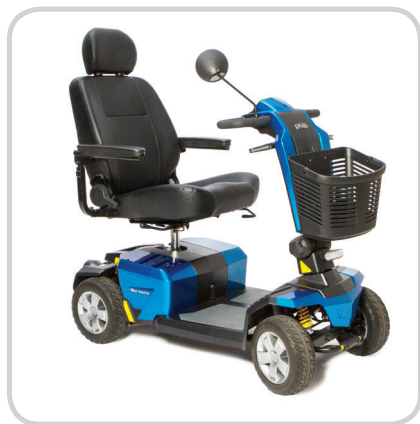
Shown in True Blue